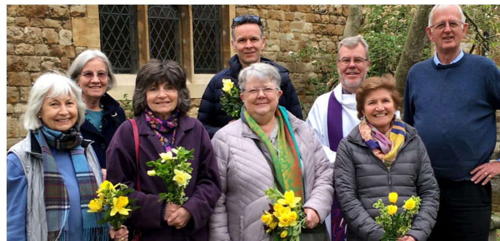
The project team from Christ Church, West Wimbledon.

Read more about supporting refugees and asylum seekers on the Southwark JPIC page, including resources: bit.ly/3nlcrFM