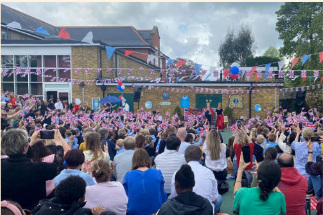
Fit for a King and Queen At St Michael’s Church of England School, Wandsworth pupils gathered in the playground to take part in a special Coronation celebration, complete with a tree planting ceremony, music, acting, and dance performed by pupils.