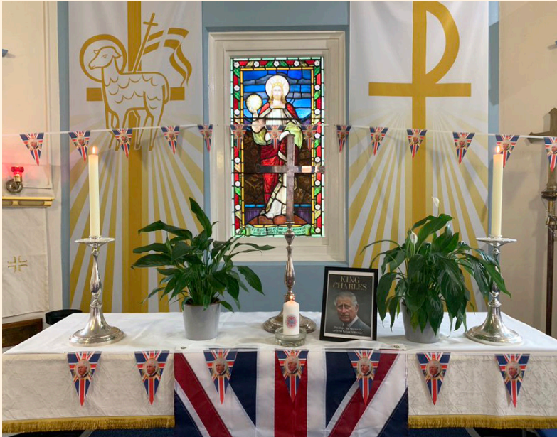
Croydon Heath Services The Chaplaincy and Spiritual Care Team at Croydon Health Services dressed their worship centre in preparation, lighting a special Coronation candle for prayer and reflection.