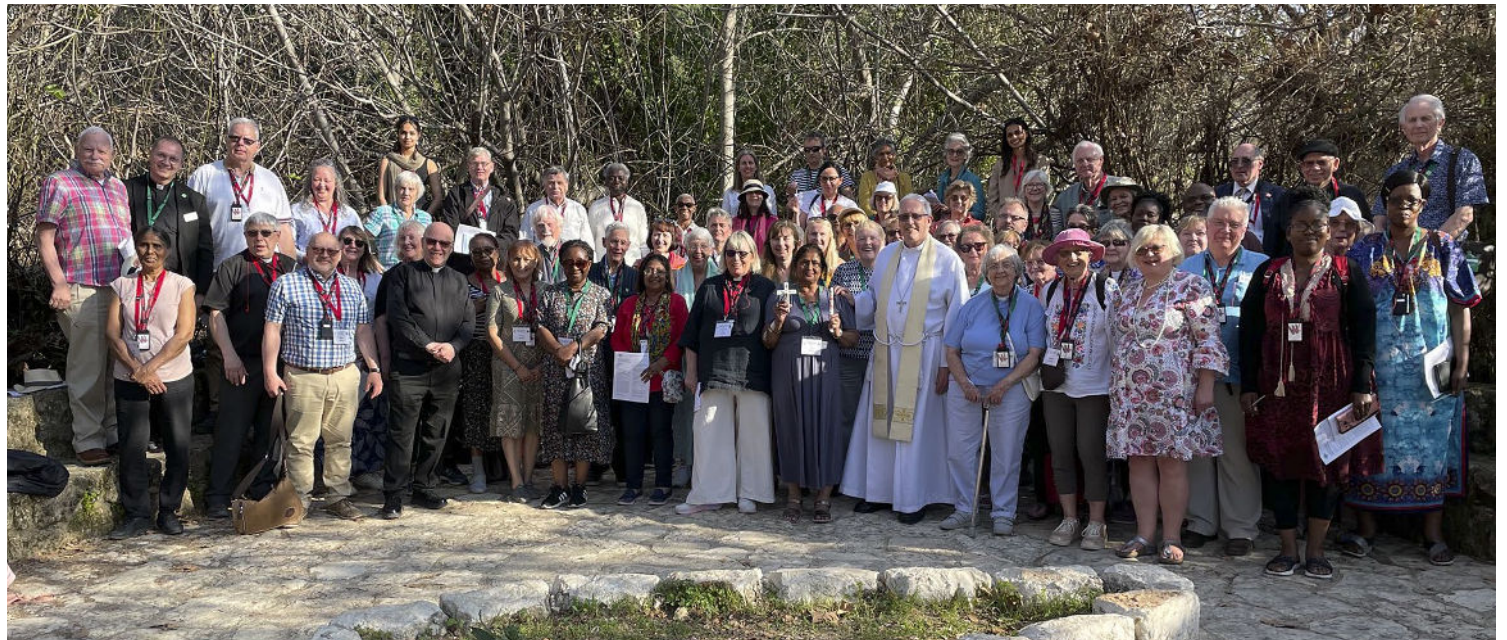
The pilgrims at a visit to Bania, where they renewed their baptismal vows.

“We have wanted to go on a pilgrimage to the Holy Land for some time and during November leaflets were distributed in our church, St Michael and All Angels, Wallington detailing the pilgrimage. We booked, and our first introduction was a meeting at Southwark Cathedral at the end of January. Here we met some of our