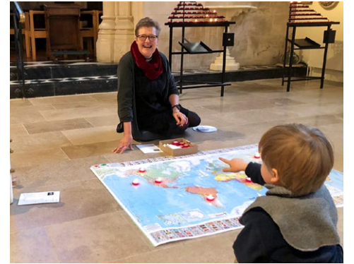
Top: Children listening to a story during Saturday church. Bottom: A child praying and lighting a candle for the world.

The children's service now has a distinct congregation, including families who do not attend other services. It is a welcoming space which seeks to encourage each person's own spirituality and to equip children in their own relationships with God.