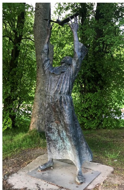
Clockwise from top left: Columba’s Well; statue of Columba in Derry, Londonderry, Northern Ireland; Stroove Beach, County Donegal.