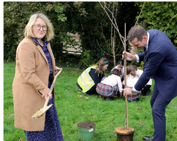
Children and staff of Bacon's College keenly engage in environmental activities including tree planting.

Schools across the Diocese are working on sustainability action plans and since September 2020, all electricity supply at Bacon's College comes from 100% renewable energy sources.