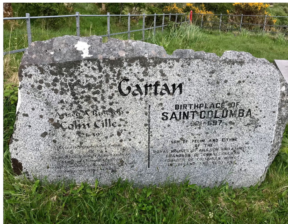
St Columba’s birthplace, County Donegal, Ireland.