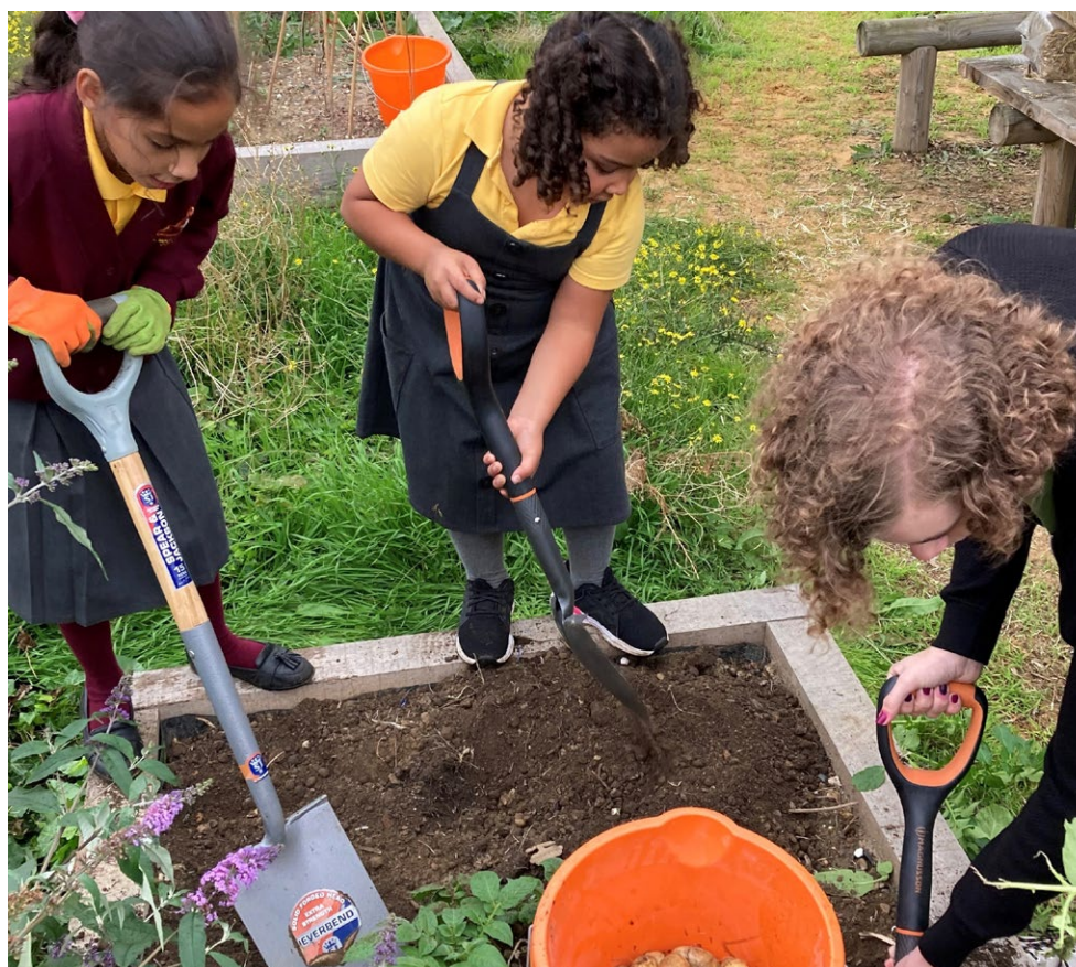
Messy Church participants harvest potatoes and work into the evening on their plant beds.