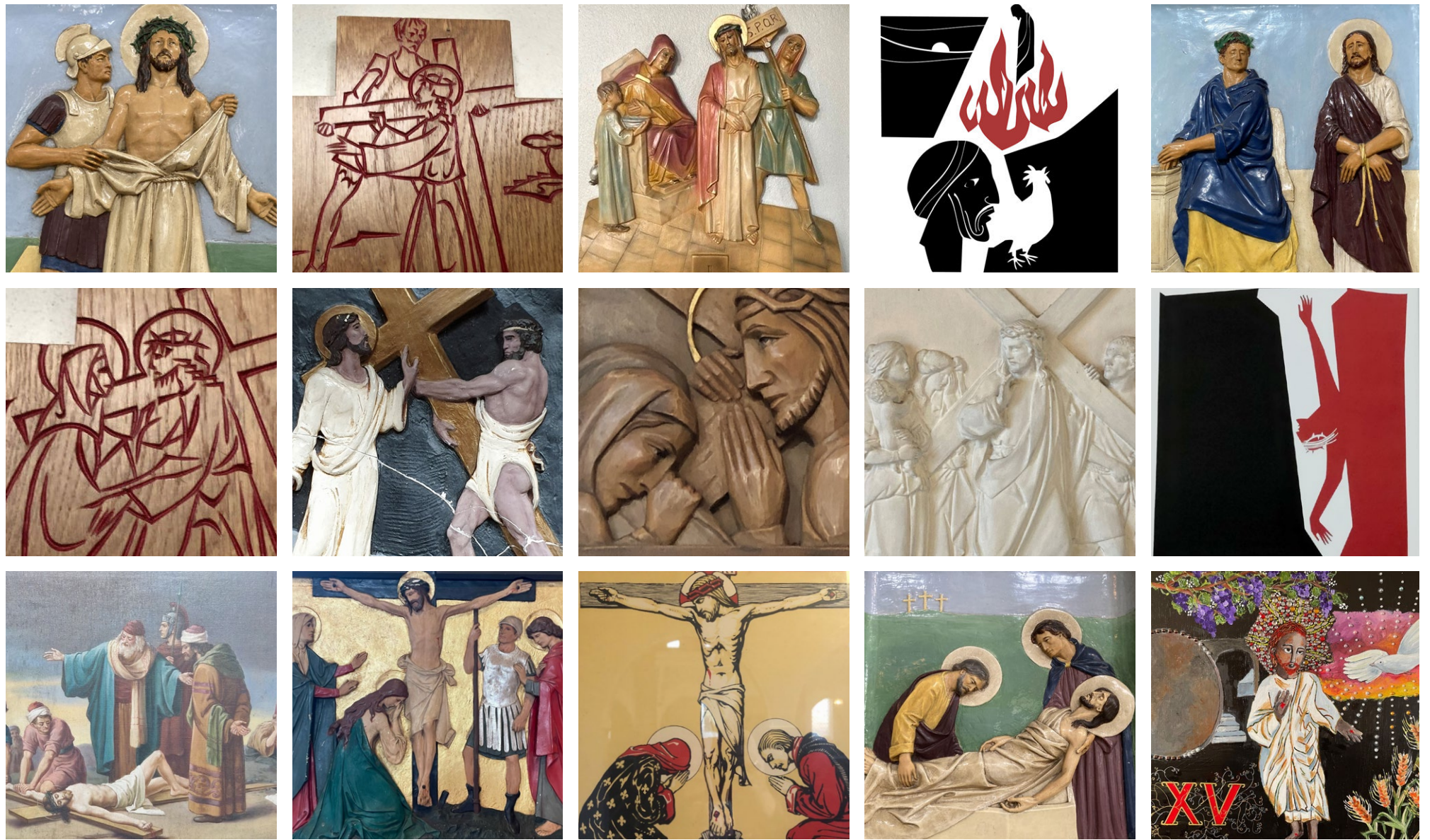
Contributing parishes (in no particular order): St Clements with St Peter, Dulwich; St John, East Dulwich; Christ The King, Salfords; Christ Church, Streatham; St John, Kennington; St Edward, Mottingham; The Ascension, Lavender Hill St Luke, Woodside; All Saints, Benhilton; St Mary, Battersea.