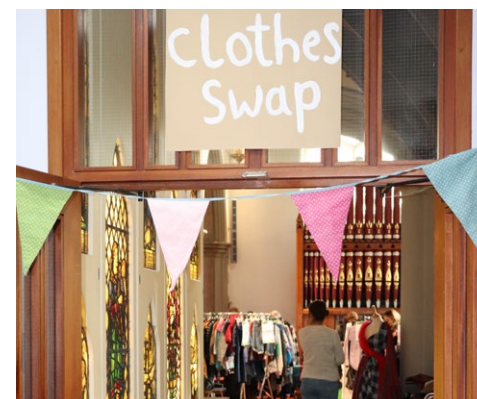
The EcoFair at St Luke, Kew offered 'gardens in a jar', free bike health-checks and a clothes swap area.