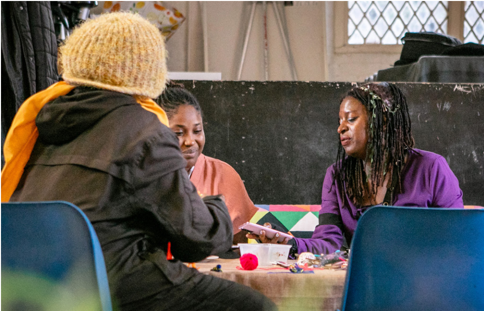
Top: Peckham Pantry, a member-based social supermarket. Middle: Pecan women’s drop-in group. Left: A helper at Southwark Foodbank.

Pecan’s Women Service supports women from all backgrounds, including those affected by the criminal justice system. It also offers advocacy, drop-ins, and a safe space. Its newest project, Together Community Space is a social safe space that operates as a café and warm space every Monday and Tuesday, from 1–3pm. This community venue offers free creative courses, workshops and awareness events throughout the year and space for meetings. Employment Support is Pecan’s longest running project and continues to support community needs. Today, Employment Support collaborates with community organisations for training and placements, as well as running accredited courses. Run by a team of staff and volunteers, Pecan recently welcomed its new CEO, Peter Edwards. Following his appointment, Peter said: