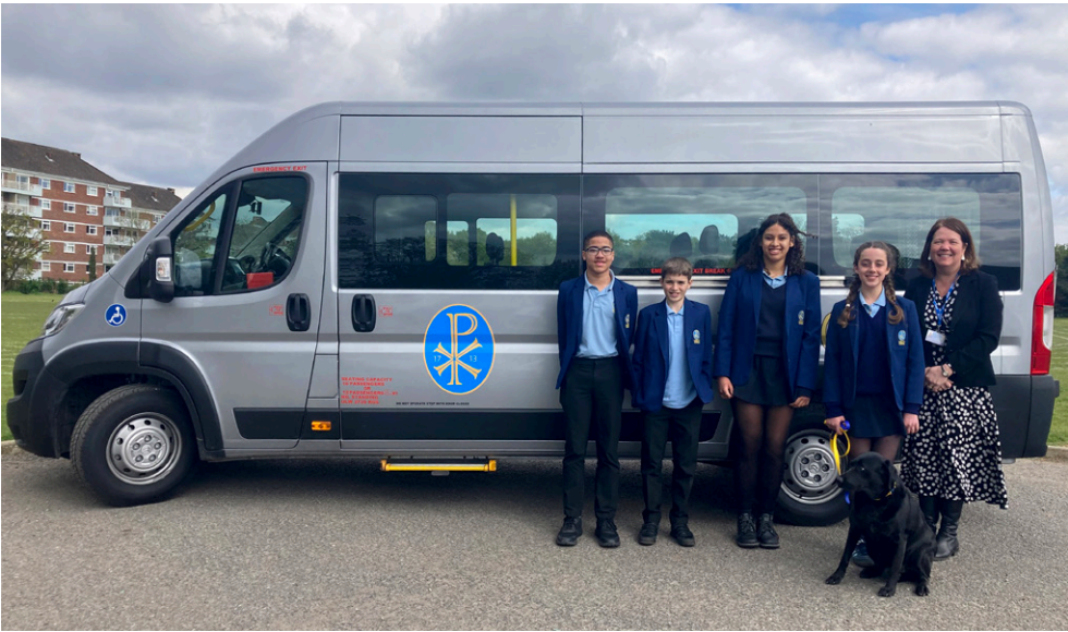
Students of Christ’s School, Richmond, appreciative of the new minibus.