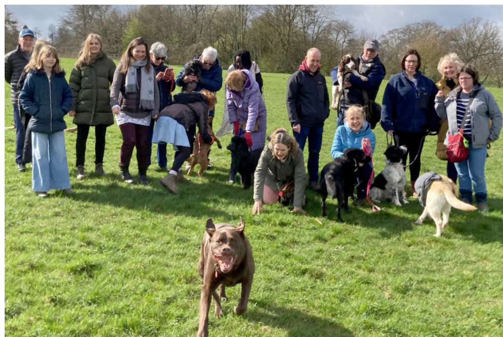
The Good Shepherd, Carshalton Beeches annual fundraising dog walk.

So many schools and parishes held special services, events and activities to fundraise. Church members at The Good Shepherd, Carshalton Beeches held their annual fundraising dog walk. Together in fellowship and friendship, the group – which included friends from the local community – set off to walk along Oak's