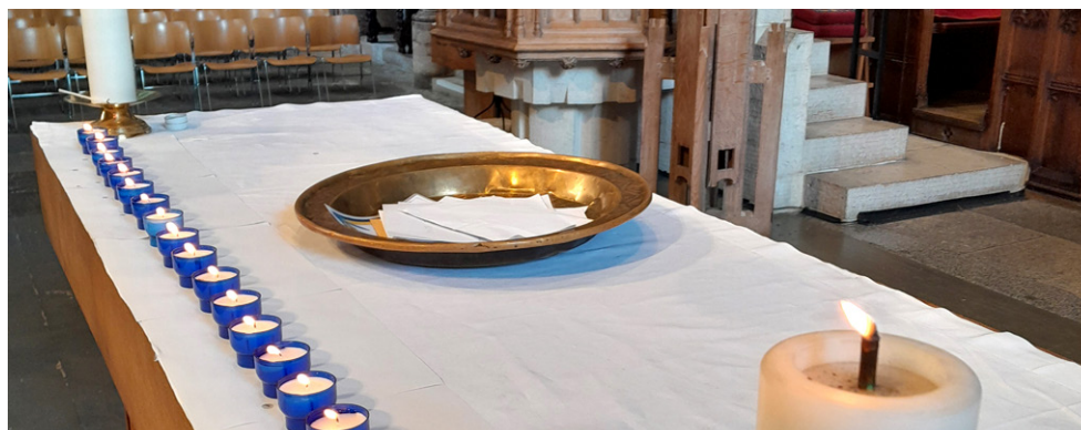
Lent Call thanksgiving service for our diocesan family of schools.

Although the Lenten season has ended, we hope that you will still feel able to continue to give generously throughout the year. Please share your stories and tell us how you raised funds in your church or school community. More information at: bit.ly/41Wtpj2