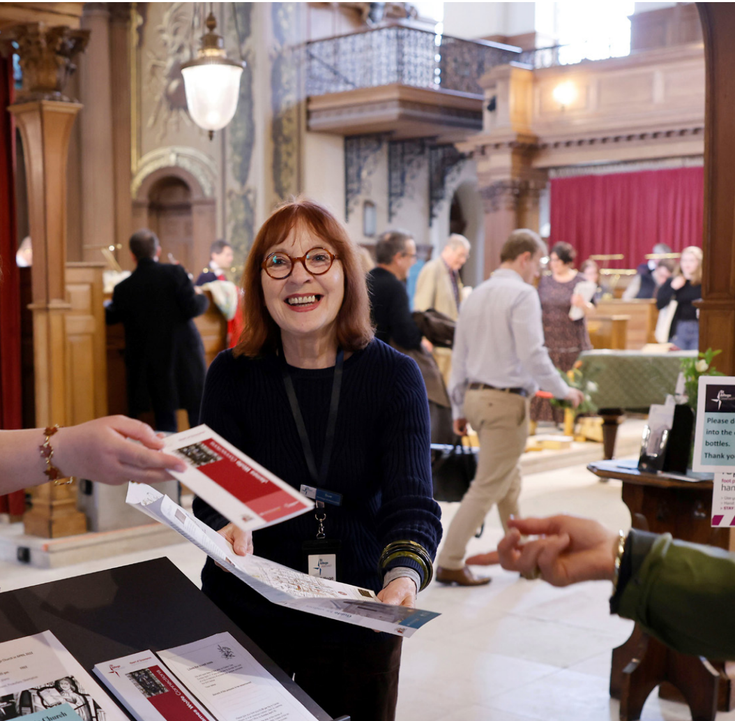
at St Alfege.