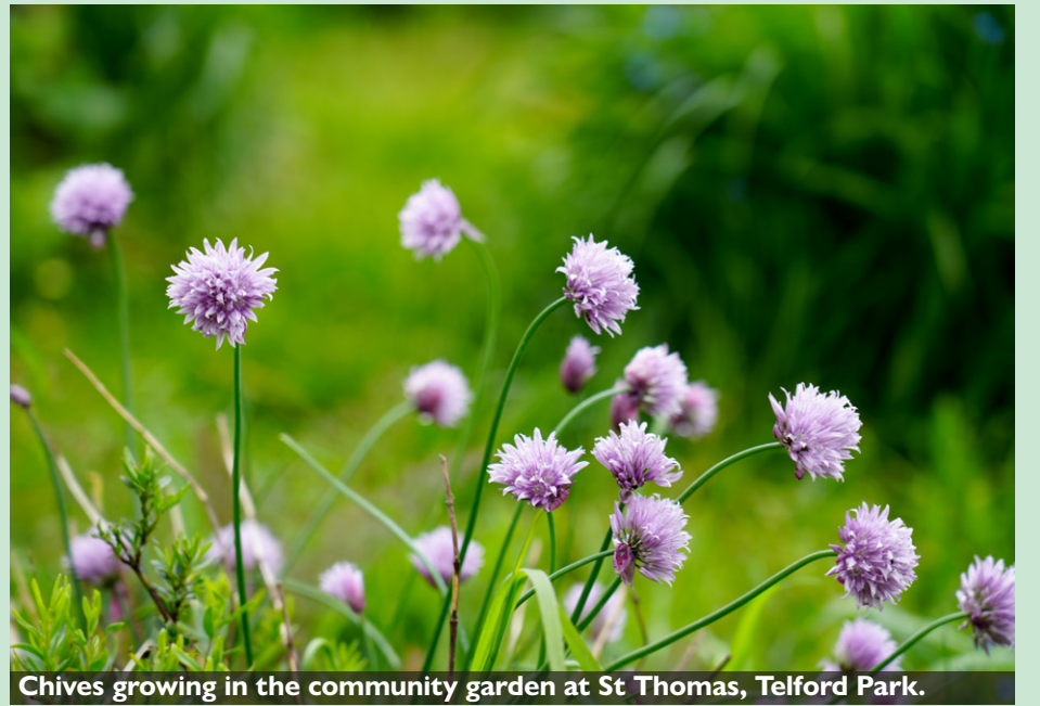
Chives growing in the community garden at St Thomas, Telford Park.

Whether you're in the leafy countryside or the inner city, please share with us what your church is doing to make an impact. Please send your stories to us by Wednesday 7 August to: bridge@southwark.anglican.org