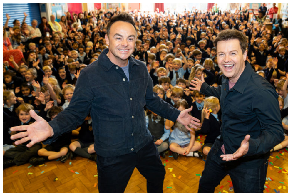
Ant and Dec with pupils and teachers of St Michaels Primary School.

Children in classroom 5S had the opportunity to ask Ant and Dec questions, including what they were currently saving for, their largest purchase to date, their ethical investments, and what they spent their pocket money on when they were younger. There was even