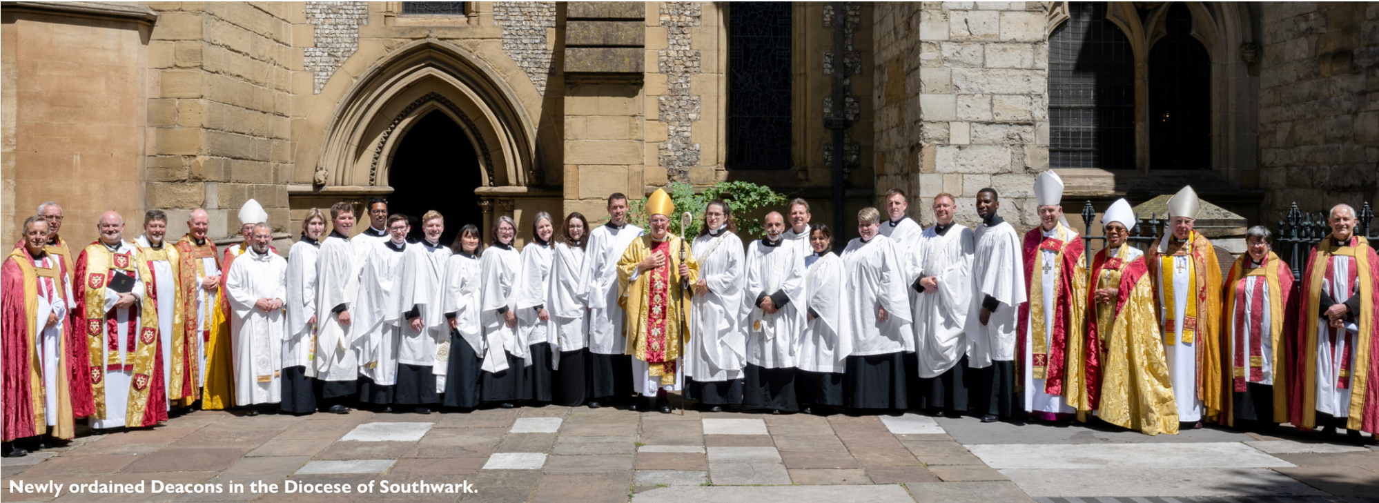
Newly ordained Deacons in the Diocese of Southwark.