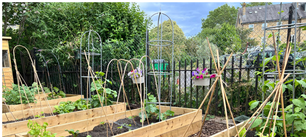
The community garden at Holy Trinity, Barnes harvested more than 60kg of produce for their local foodbank in 2023.

Having our hands in the soil deepens our connection with God, our creator and his creation. We want to provide sanctuary space for both humans and wildlife. The vegetable patch has become a place where people can pause and take a deep breath.