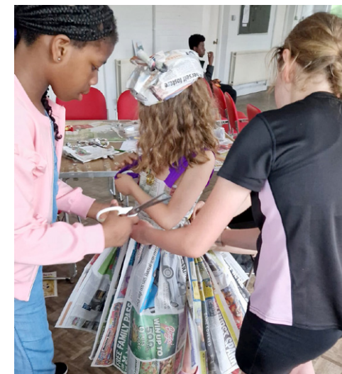
'Fireflies' prepare and display their creative outfits.