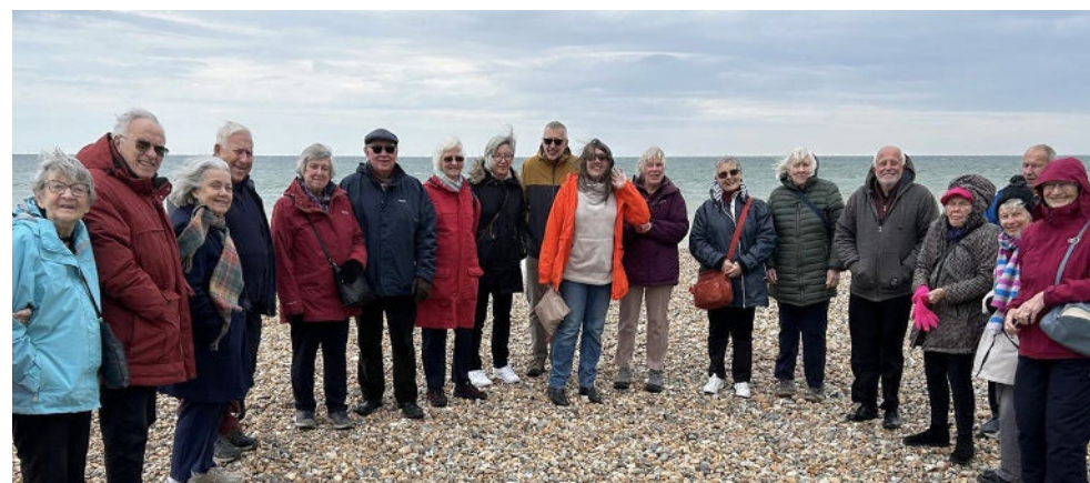
Members of St John the Evangelist, Old Coulsdon, gather on Worthing beach for prayer and reflection.