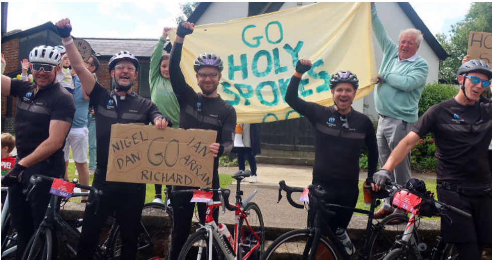
The ‘Holy Spokes’ team who raised funds for their church and hall.

The all age service was set to a ‘bring your scooter or bike to church’ theme, packed with appropriate activities, amended song lyrics and even a reimagining of Psalm 23