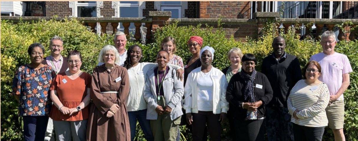
Bishop’s Certificate participants gathered at Wychcroft retreat house.

When asked what the best part of the course has been, one of this year’s participants said, “Being taken to parts of the Bible I hadn’t looked at in a while, learning lots of new things about church, Christian history and the Anglican church”. Others commented on the high quality of the teaching, the supportive community amongst their fellow participants, and the chance to ask questions about the Christian faith in a non-judgemental environment.