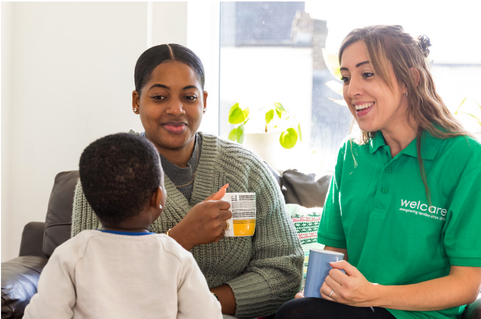
Welcare, supporting families of all faiths and none.

Over the last three years Welcare piloted a new group work programme, delivered in school to children in Key Stage 2. It aims to build emotional health, wellbeing and resilience of children and is called CapeAbility in School the course refined in response to the huge increase in children experiencing mental health challenges exacerbated by the Covid-19 lockdowns. Welcare relies on the support and prayers of the Diocese of Southwark