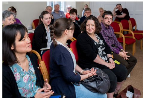
Training for ministry at St Augustine's.

We hear little in mainstream media about the mounting passion among Christians to know what discipleship means when our planet is in such crisis. This is a hopeful passion, partly because Christians have greater resources of wisdom and more inspiring examples of practice that we quite realise. More importantly, it is hopeful because 'God so loved the world' does not mean just us – it means all of life and the complex systems on which all life depends. For many, the scope of discipleship has now grown wildly beyond what we have imagined in the past.