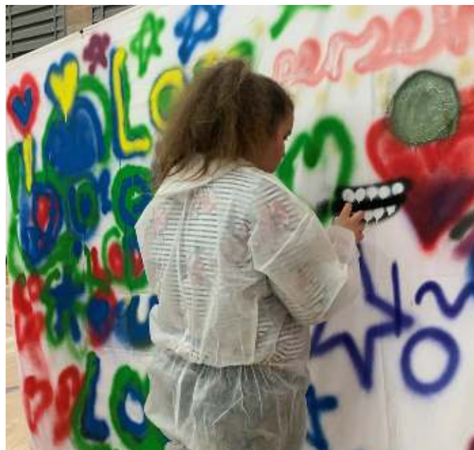
Street art at Woolwich Youth Forum Day.