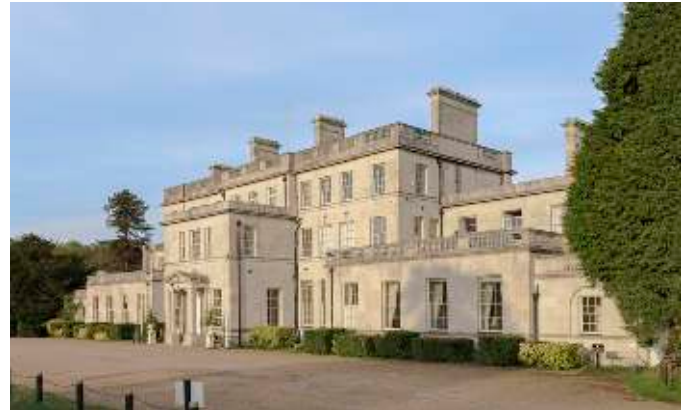
Addington Palace, Croydon.

and their contributions to our Synod meetings bring diversity in leadership to the very fore.