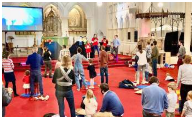
'Bubble Church' at Ascension in Balham.

Our fourth and fifth objectives relate to how we grow those that minister and serve and touch the very heart of the conference. We seek to grow ordained and lay vocations by 50% by 2025. We have had some exceptional growth in ordained vocations and have recently introduced some new lay ministries. We are committed to more curates and to having 100 pioneer ministers, lay and ordained, within 10 years, many of whom are already in our parishes. This year, more than half of our new deacons are pioneer curates across the Diocese and across churchmanship. We also seek to ensure our leadership reflects the communities we serve; we have launched our Anti Racism Charter whilst initiatives such as the Woolwich Youth Forum