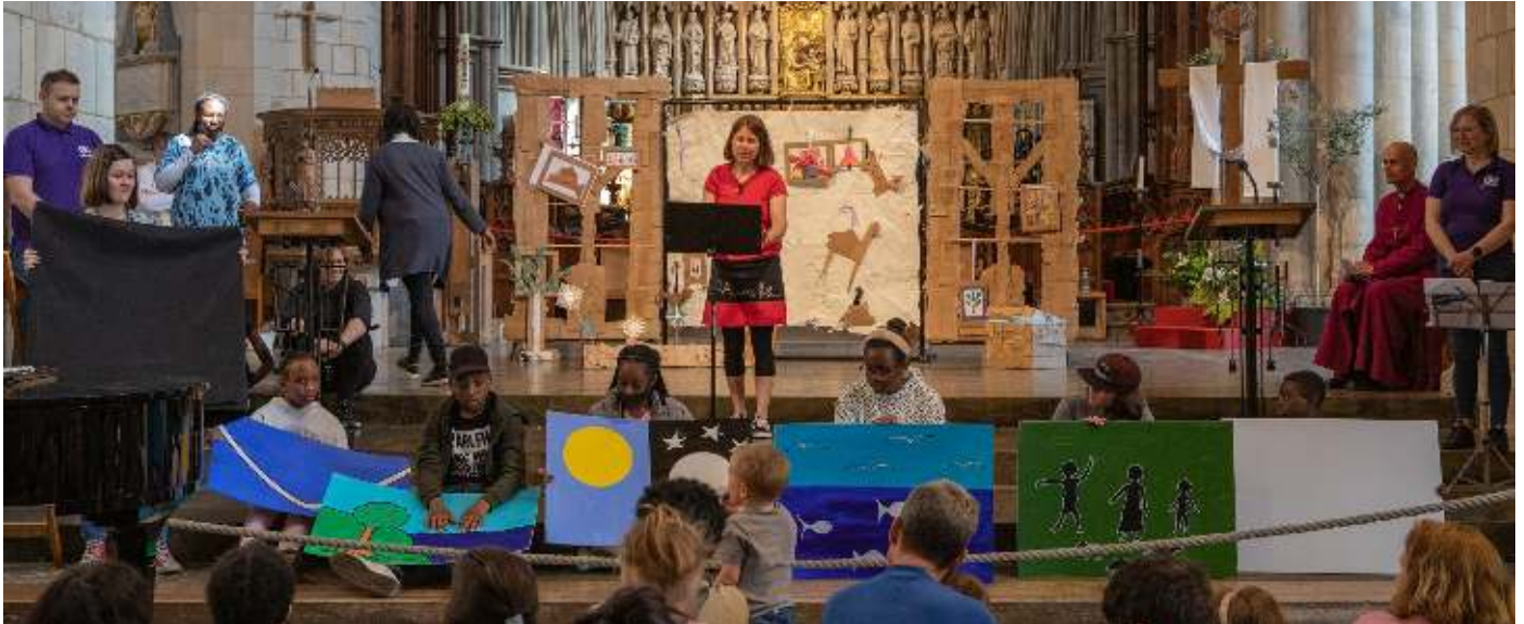
Southwark Cathedral 'Does Messy Science' (2022).

Our vision is to see children and young people (CYP) with hearts on fire for Jesus, growing in faith with the confidence to share it and contributing to the life of the Church and its mission, at every level.