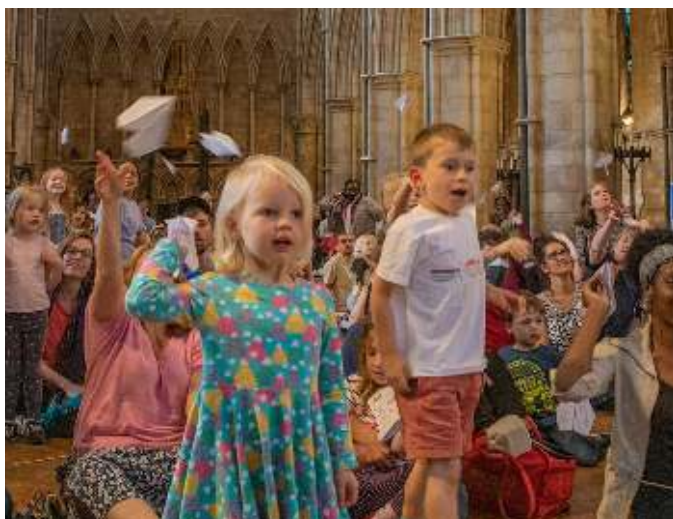
Southwark Cathedral 'Does Messy Science' (2022).

Our free lending library of equipment for parishes and schools is available, with free delivery and collection of smaller items (Terms and conditions apply). Download our catalogue and borrow items from bit.ly/3PgdUvv