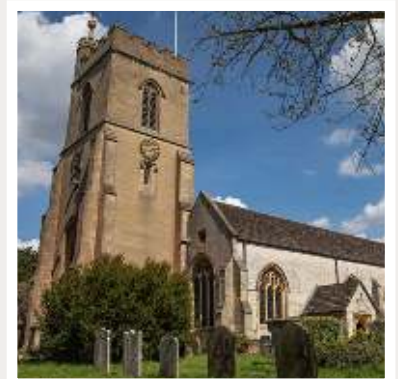
A photographic reflection across our parishes in the Diocese of Southwark. Location photos © Eve Milner and Ryan Prince.