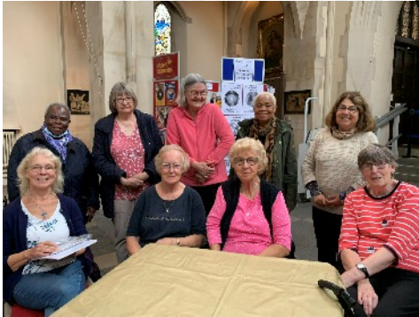
Deanery meeting at St Alban's South Norwood