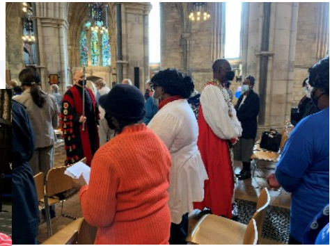
Festival Service at Southwark Cathedral