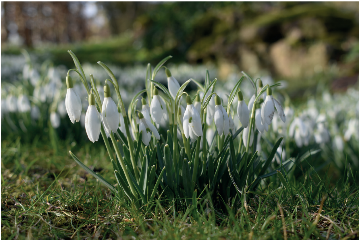
Snowdrops at Wychcroft, the Southwark Diocese Retreat Centre, photographed in 2020 by Richard Ellis.

Trinity House is the office of the Diocese of Southwark and can be found at 4 Chapel Court, Borough High Street, London SE1 1HW. The telephone number is 020 7939 9400.