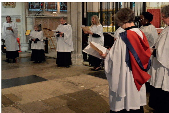
Southwark Readers' service in 2020.