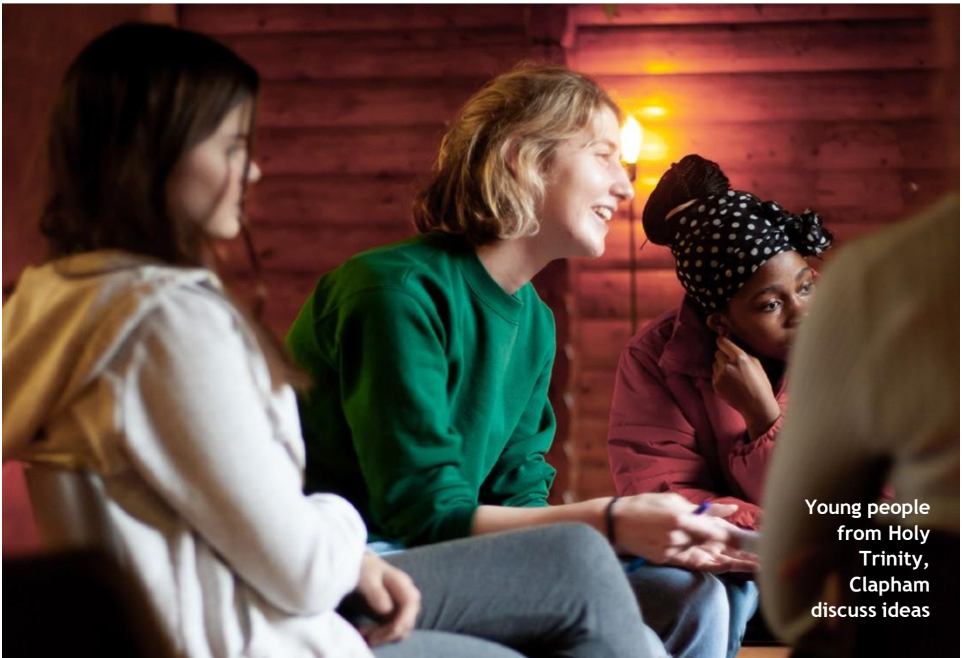
Young people from Holy Trinity, Clapham discuss ideas