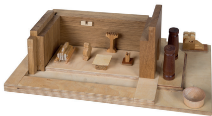
GP5 The Ark and the Temple