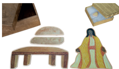
GP9 Parable of the Leaven