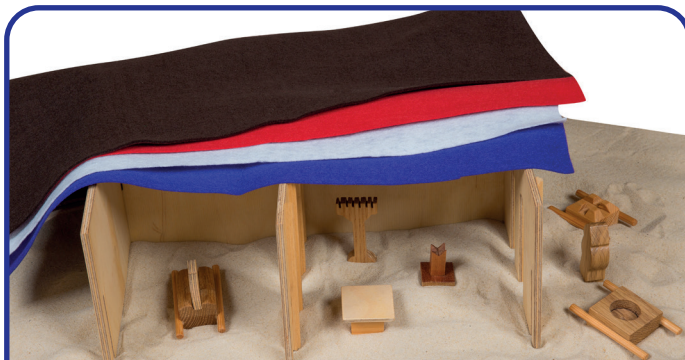
GP4 The Ark and the Tent