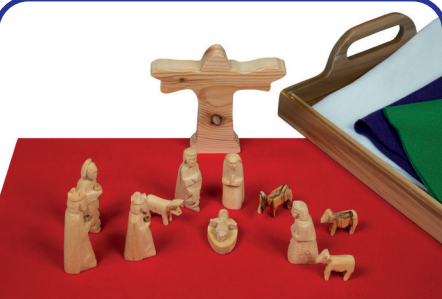
GP8 The Holy Family