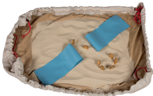
GP3 The Exodus (collection only)