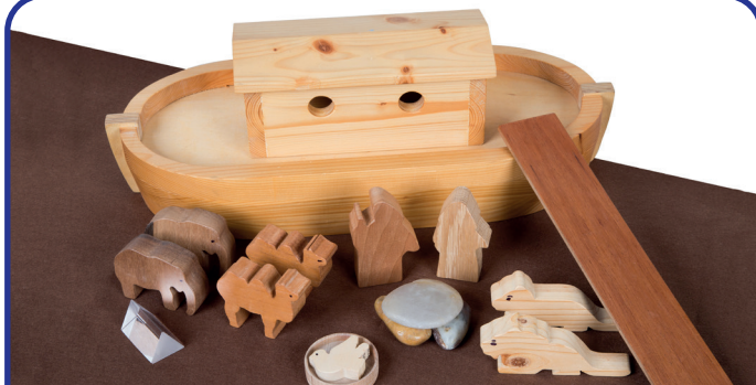
GP2 The Flood and the Ark