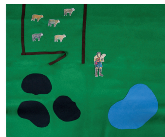
GP10 Parable of the Good Shepherd