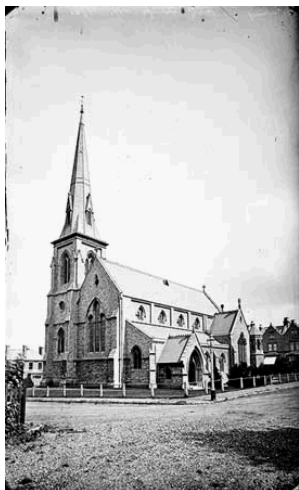
Old photo of the church