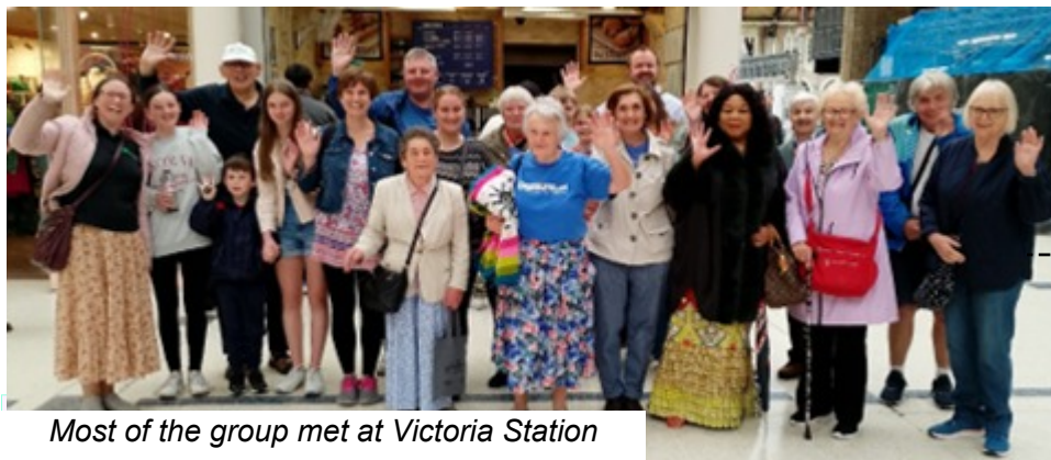
Most of the group met at Victoria Station